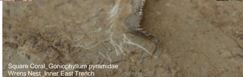
Square Coral Goniophyllum pyramidae Wrens Nest Inner East Trench