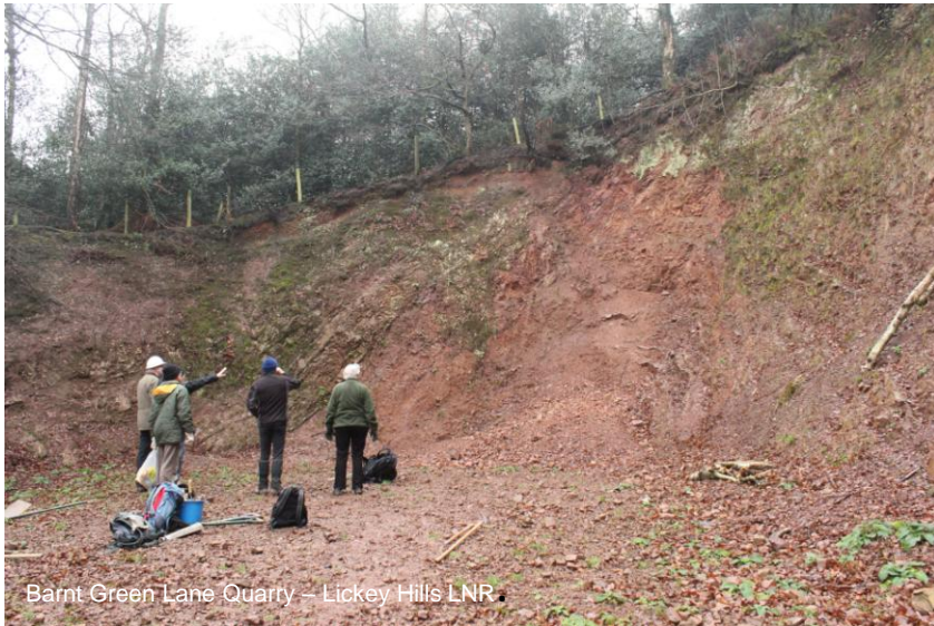
Barnt Green Lane Quarry – Lickey Hills LNR.