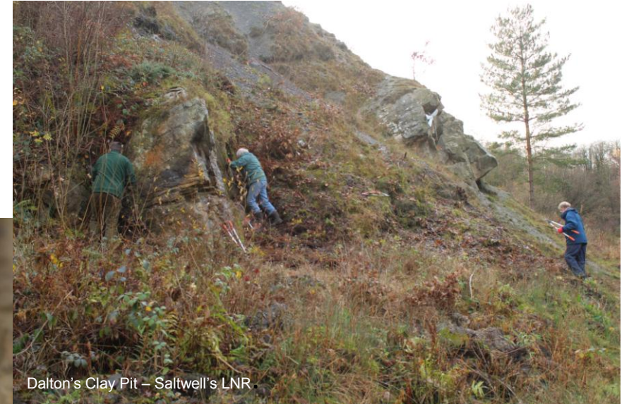
Dalton's Clay Pit – Saltwell's LNR.